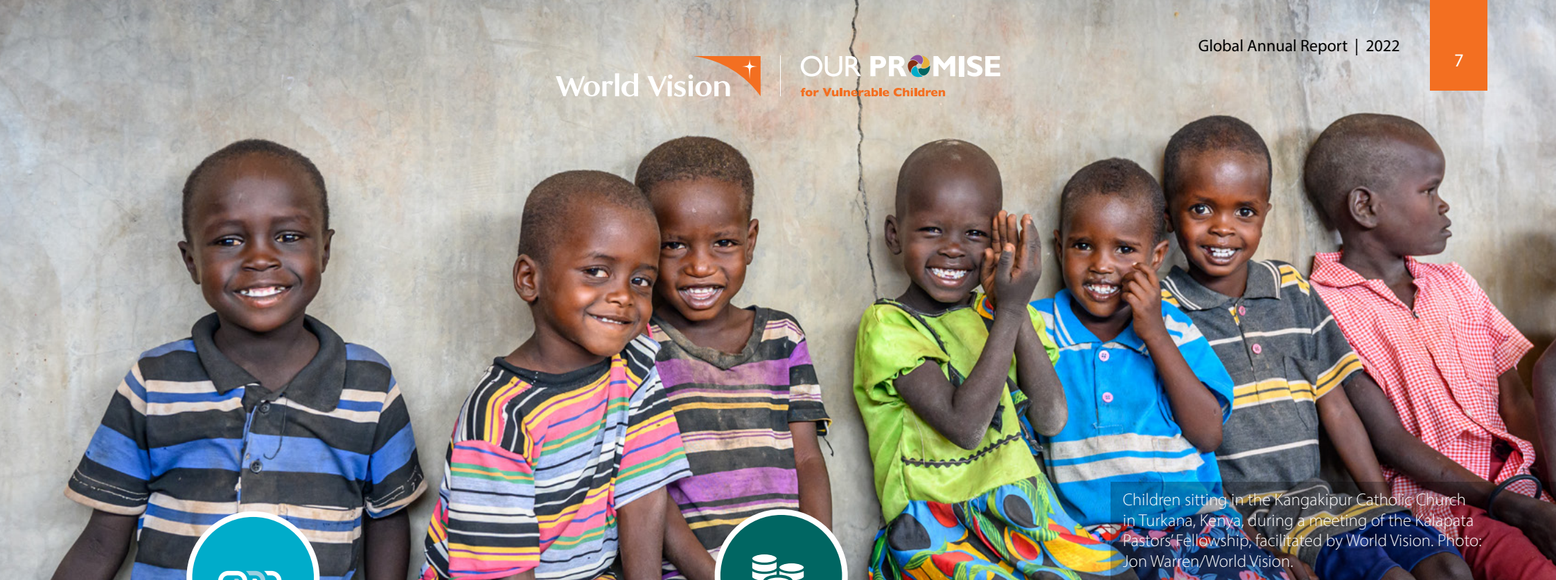
Children sitting in the Kangakipur Catholic Church in Turkana, Kenya, during a meeting of the Kalapata Pastors' Fellowship, facilitated by World Vision.